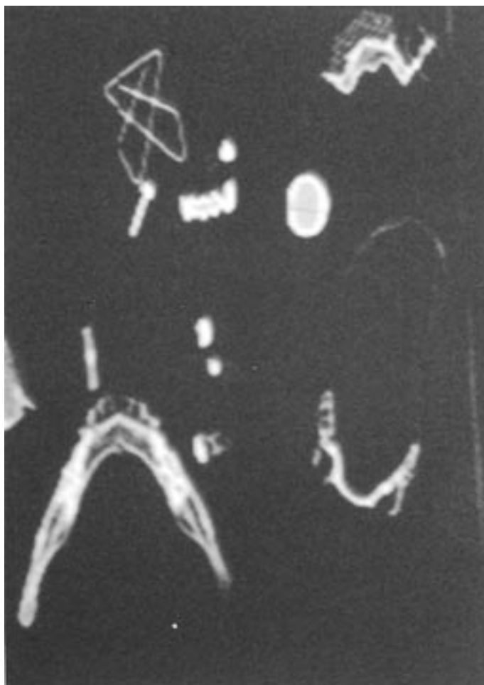
FIG. 1— Simulated bag.

A second body bag (#2) was prepared. Into this bag a human maxilla and mandible containing teeth with restorations, loose teeth both with and without restorations, an acrylic full denture, acrylic partial denture, a metal partial denture, a small plastic pencil sharpener in the shape of a toy gun, a small metal ball, 3/4 in. diameter, and a metal paper clip was placed into the Linescan unit. All items were easily distinguished.