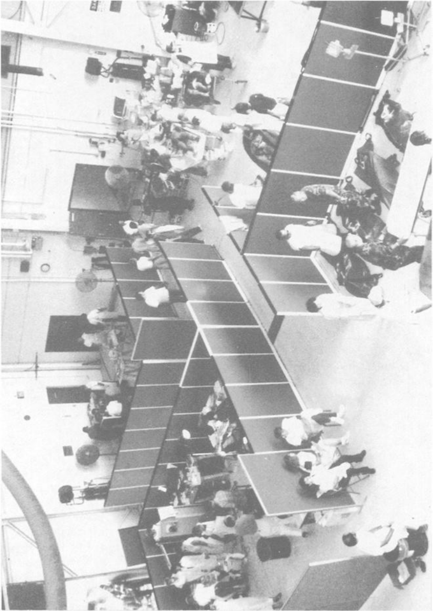
FIG. 5—Morgue operation area, showing the partitions separating the different work stations diagrammed in Fig. 4.