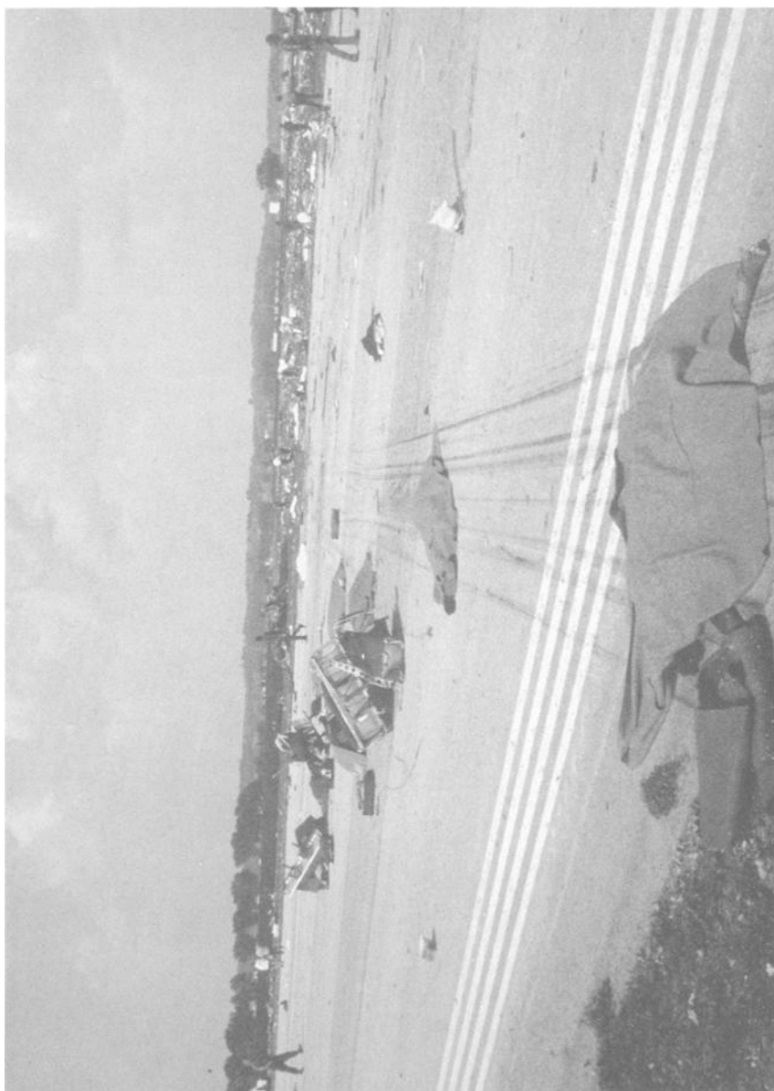
FIG. 2—Bodies scattered on the concrete runway, precluding the driving of labeled stakes to mark the body position.