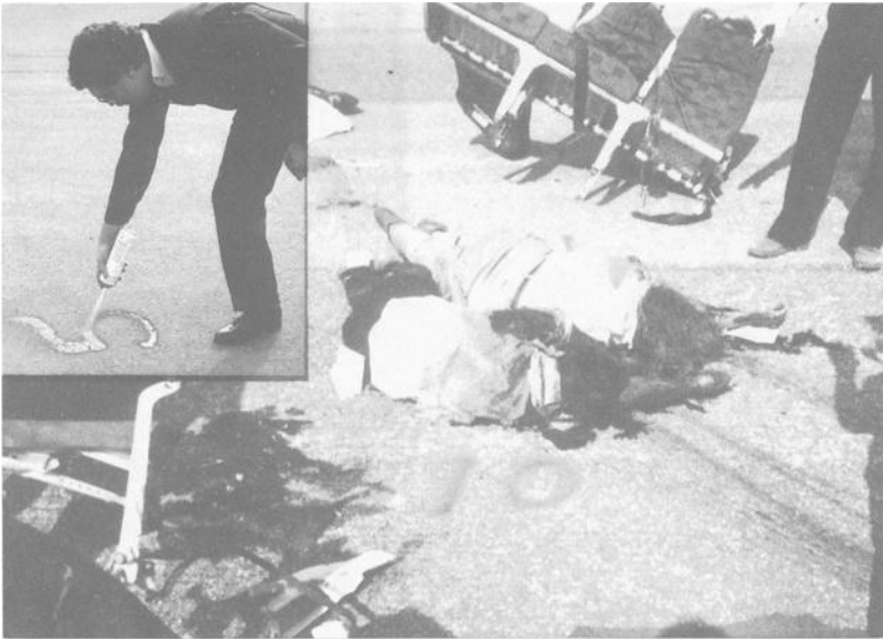
FIG. 3—Body positions marked with spray paint on the runway surface (the inset illustrates upside-down operation of a spray paint can).

Our greatest operational concern within the morgue was the loss or misplacement of information. To avoid this problem, a Red Cross volunteer (called a "tracker") was assigned to each body as it flowed through the morgue. The information folder carried by the tracker, or kept at the central repository when the body was not on the floor, was